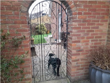
Barney at the gate into the back garden