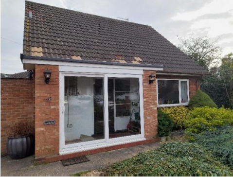
The front of Sheila's new home